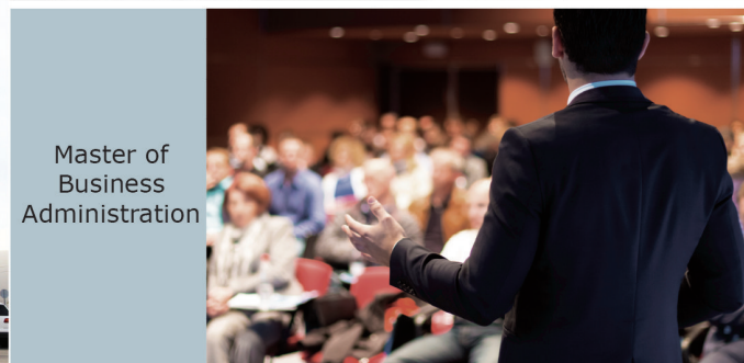
Master of Business Administration