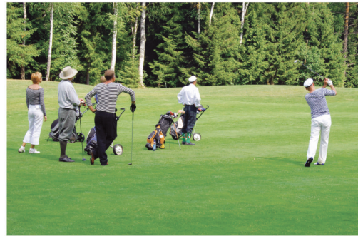
Associate of Applied Science in Professional Golf and Golf Complex Management