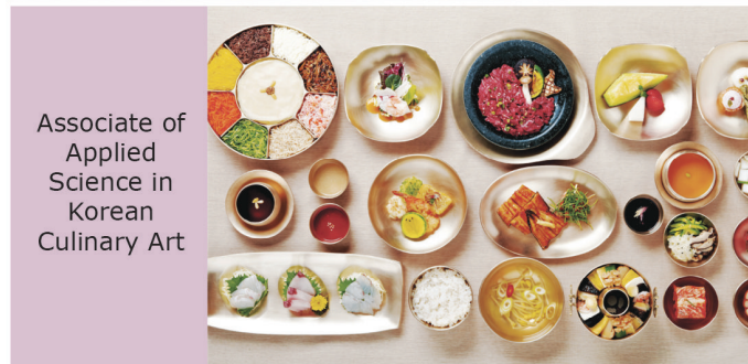
Associate of Applied Science in Korean Culinary Art