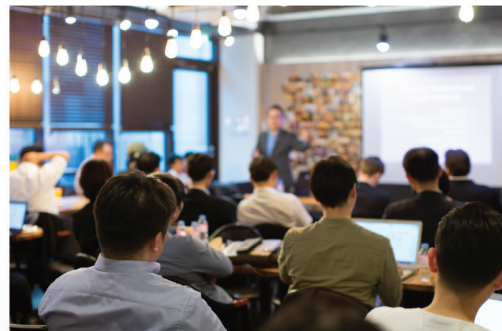
Bachelor of Arts in Business Administration